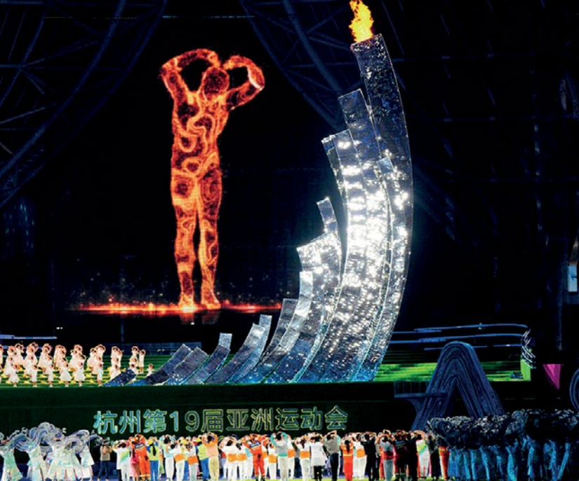
Fig. 3 The 19th Hangzhou Asian Games digital torchbearer lighting the flame and the display of electronic fireworks (left); digital torchbearer making a heart gesture at the closing ceremony (right). Source: https://www.hangzhou2022.cn/En/ .

dents' physical well-being by integrating exercise and fitness into daily life. Embedded sports facilities, such as the Hangzhou Basketball Park beneath the Shide Overpass, illustrate how individual athletic activities activate previously underutilized urban spaces. Second, the Games' digital initiatives are closely intertwined with public participation; through the digital torch relay, the event foregrounds individual engagement within the grand scale of the city-wide Games, extending the dissemination of the Asian Games spirit into various facets of social life. Finally, the concluding torchbearer delivered a unique experience for each participant: the "hybrid digital-physical" ignition ceremony, executed by a "digital torch persona" representing all participants (Fig. 3), departed from the traditional model of a single torchbearer lighting the main cauldron, marking a memorable moment in the history of the Asian Olympic movement.